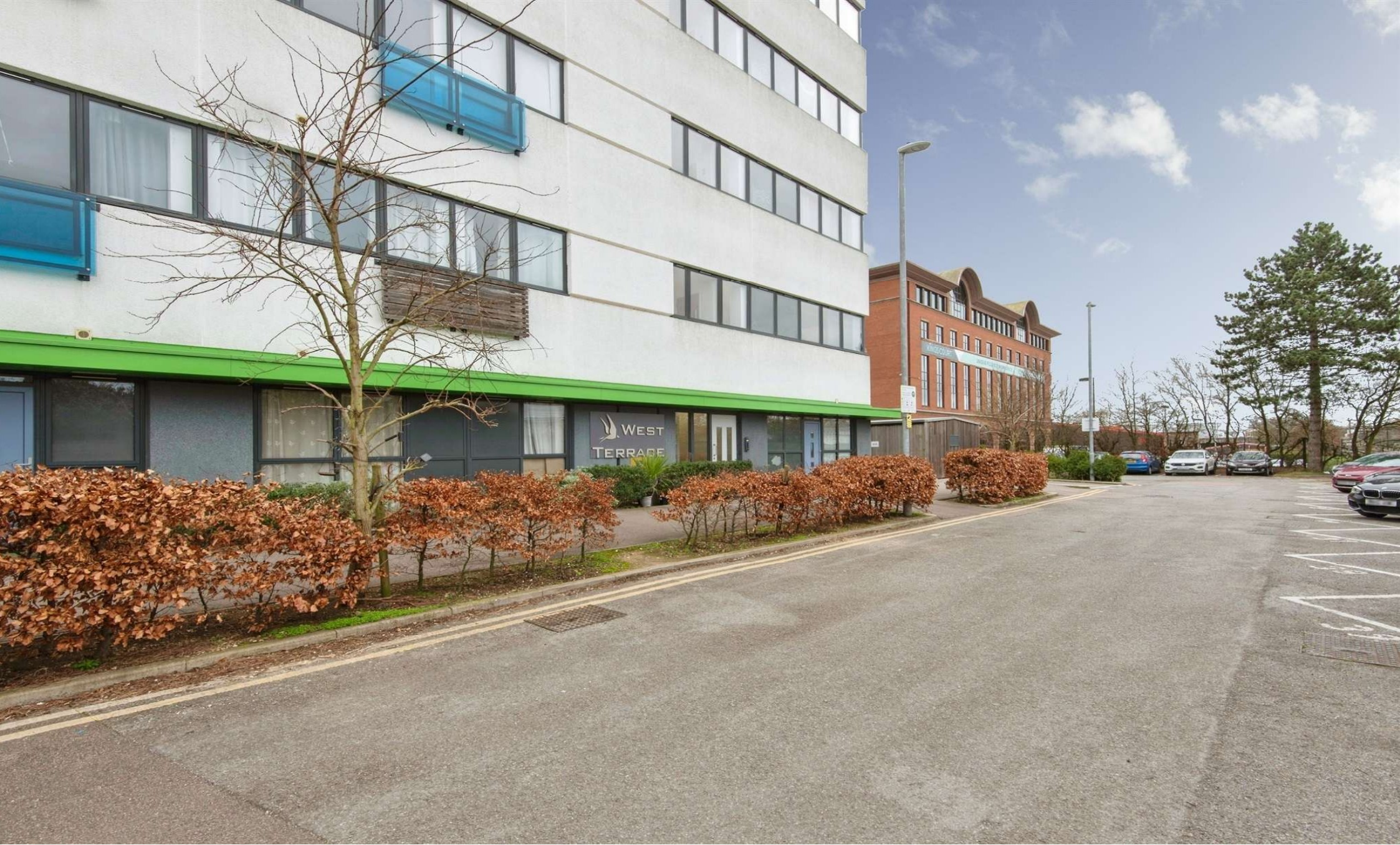
Six Hills House, Kings Road, Stevenage, SG1 1AW