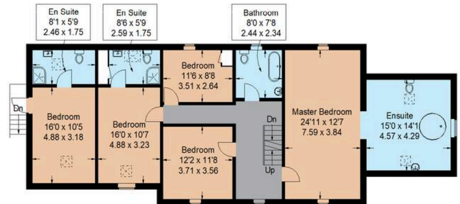
First Floor 1541 sq ft / 143.2 sq m