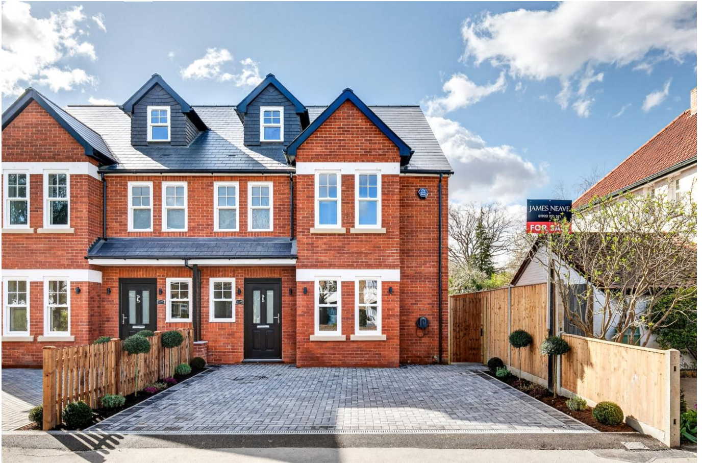
Nova, 86a Queens Road Hersham Surrey KT12 5LN