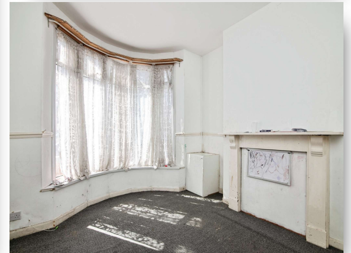
Albert Road, Aston Birmingham B6 5NL