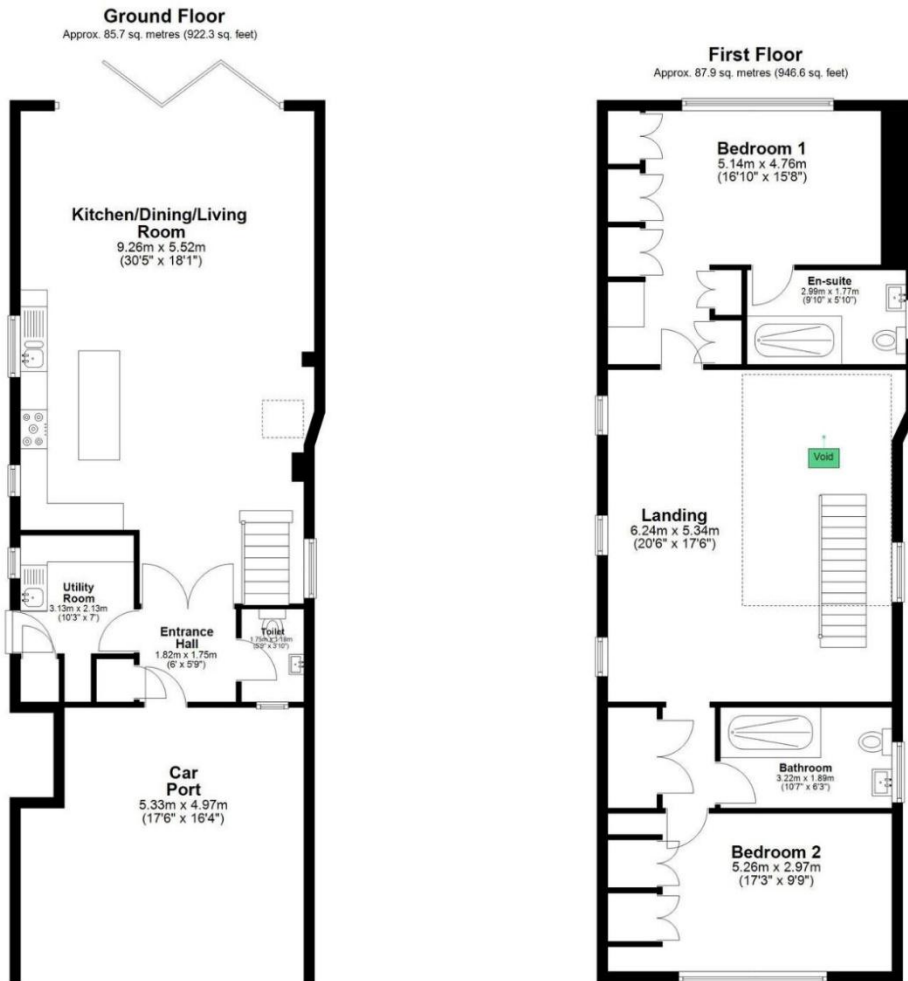
Total area: approx. 173.6 sq. metres (1868.9 sq. feet)

This is a VERY UNIQUE LUXURY TWO BEDROOM DETACHED HOME! Formerly the Wesleyan chapel dating back to the mid 1800's, THE OLD CHAPEL has been tastefully converted whilst still appreciating the history of the property. With LIVING ACCOMMODATION EXTENDING OVER 1300 SQ FT, this super home provides SPACIOUS ACCOMMODATION ON BOTH LEVELS. The property is complimented by a SECLUDED, RECENTLY LANDSCAPED REAR GARDEN and benefits from a GENEROUS CAR PORT PROVIDING COVERED PARKING FOR TWO CARS. This lovely dwelling is WELL PRESENTED THROUGHOUT and benefits from both ROAD AND TRAIN LINKS allowing the owner to enjoy country living yet with an easy commute.