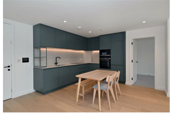
Ashbee Approx. Gross Internal Area 887 Sq Ft - 82.41 Sq M