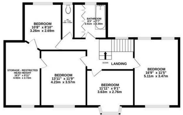
1ST FLOOR 918 sq.ft. (85.3 sq.m.) approx.