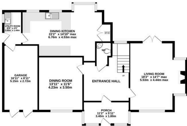
GROUND FLOOR 1054 sq.ft. (98.0 sq.m.) approx.