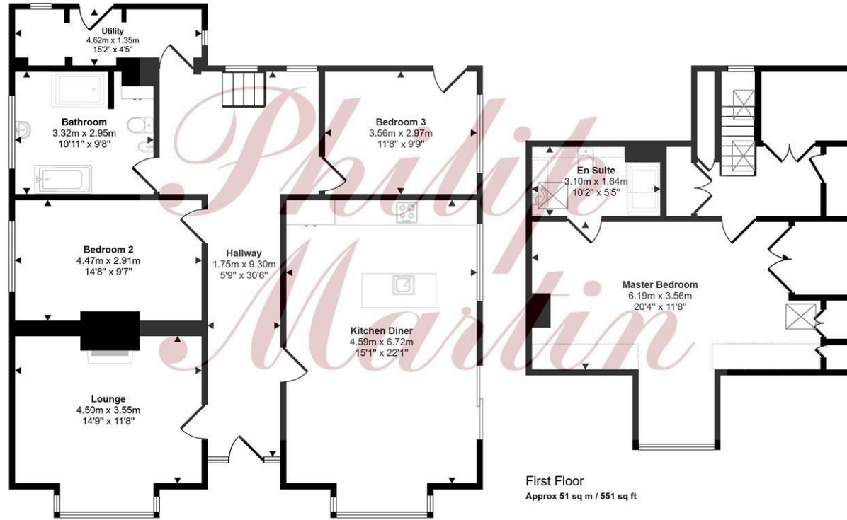
First Floor Approx 51 sq m / 551 sq ft