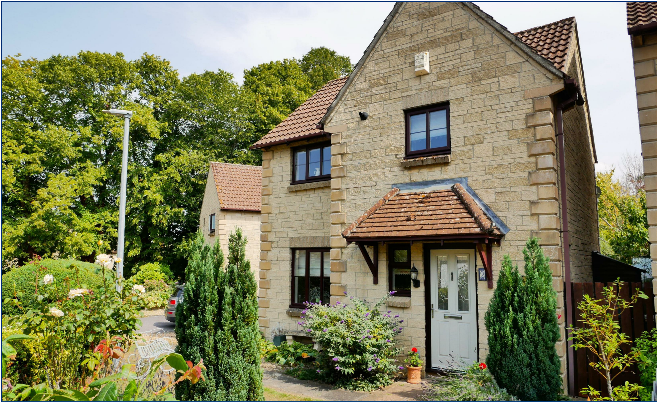
Lilac Way, Calne £379,500