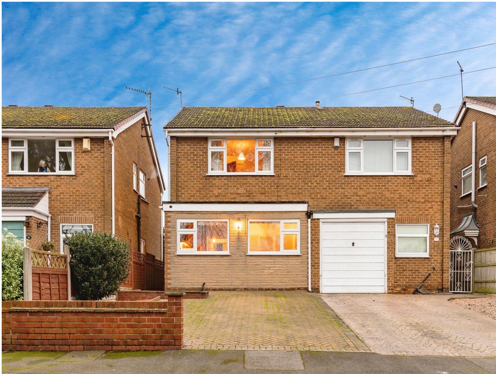
Vicarage Close, Nottingham NG5 1GH