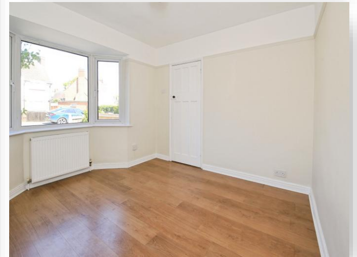
Luddington Road, Peterborough PE4 6HH