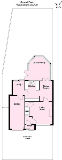
Total area: approx. 65.1 sq. metres (700.9 sq. feet) Note: Plans for illustrative purposes only. Approximate gross internal floor area. Excluding areas under cover of porches, pergolas, patios, etc. Measurements and details shown are approximate and should be independently verified. Plan produced using Planity.