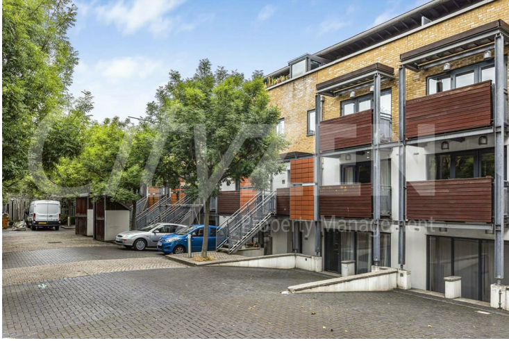
THE CHRONOS BUILDING