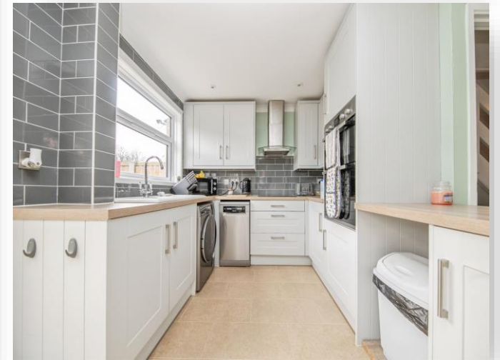
Downing Close, Ipswich, IP2 9EQ