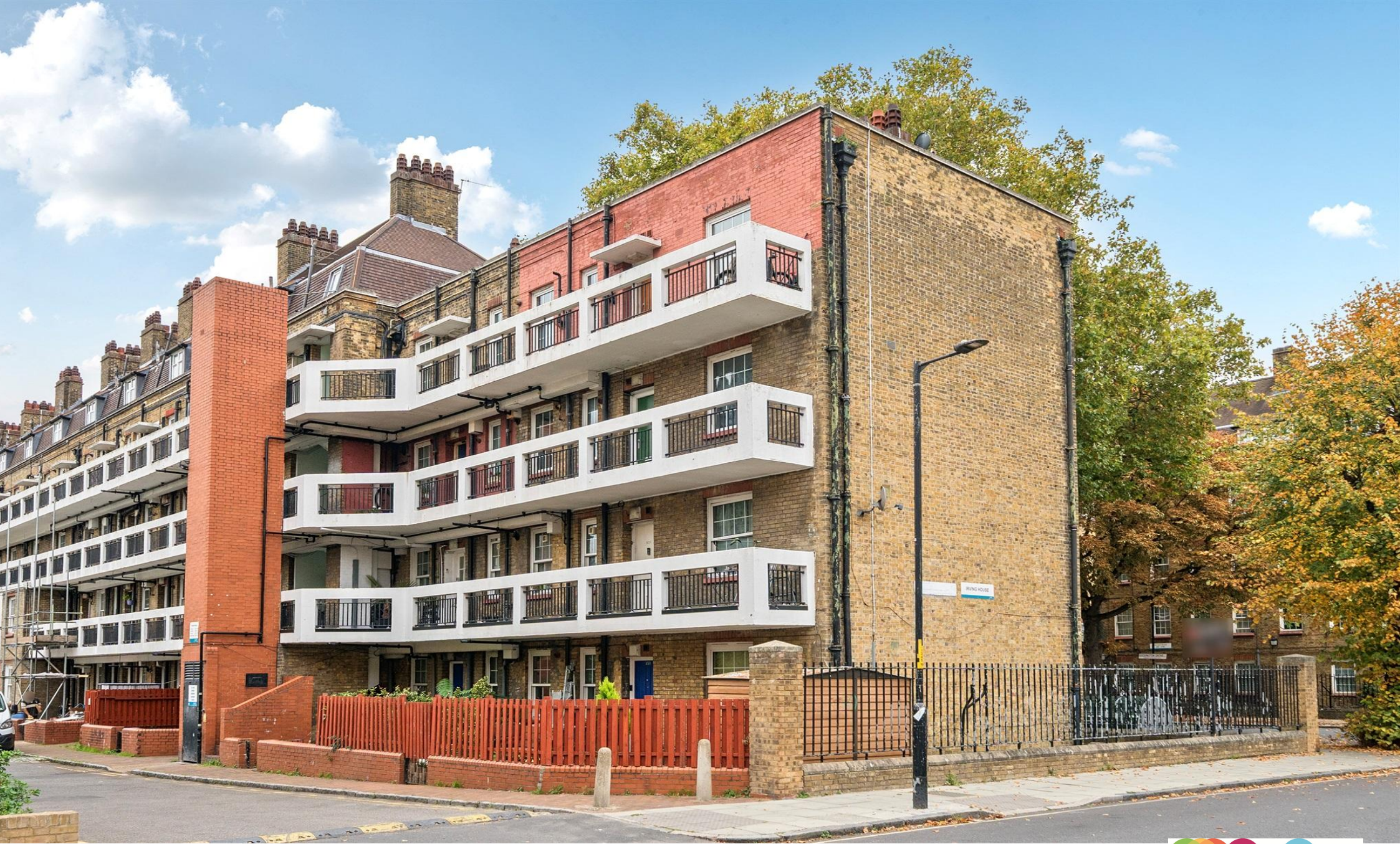
Irving House Doddington Grove, London SE17