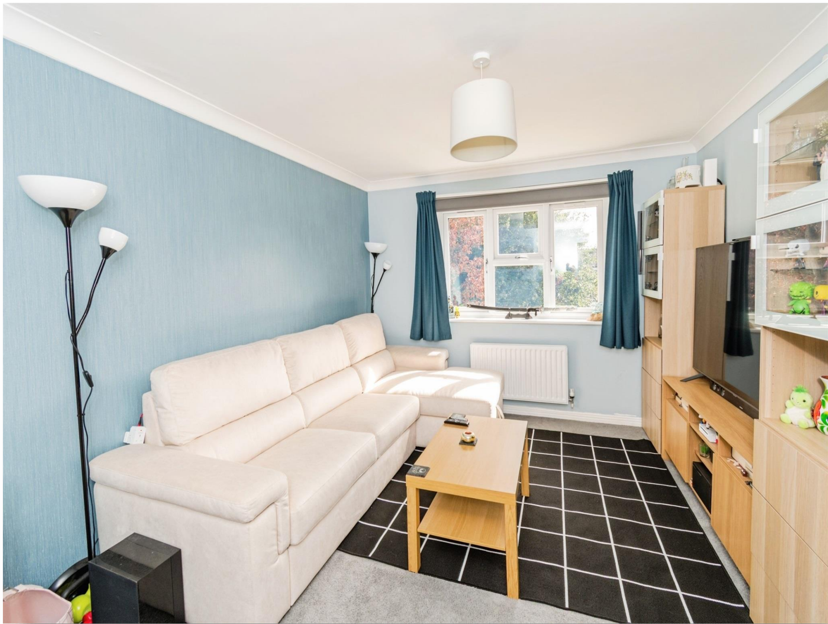
Carlisle Court, Carlisle Road, Southampton SO16 4GS