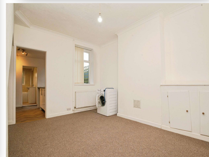
Treharris Street, Roath Cardiff CF24 3HL