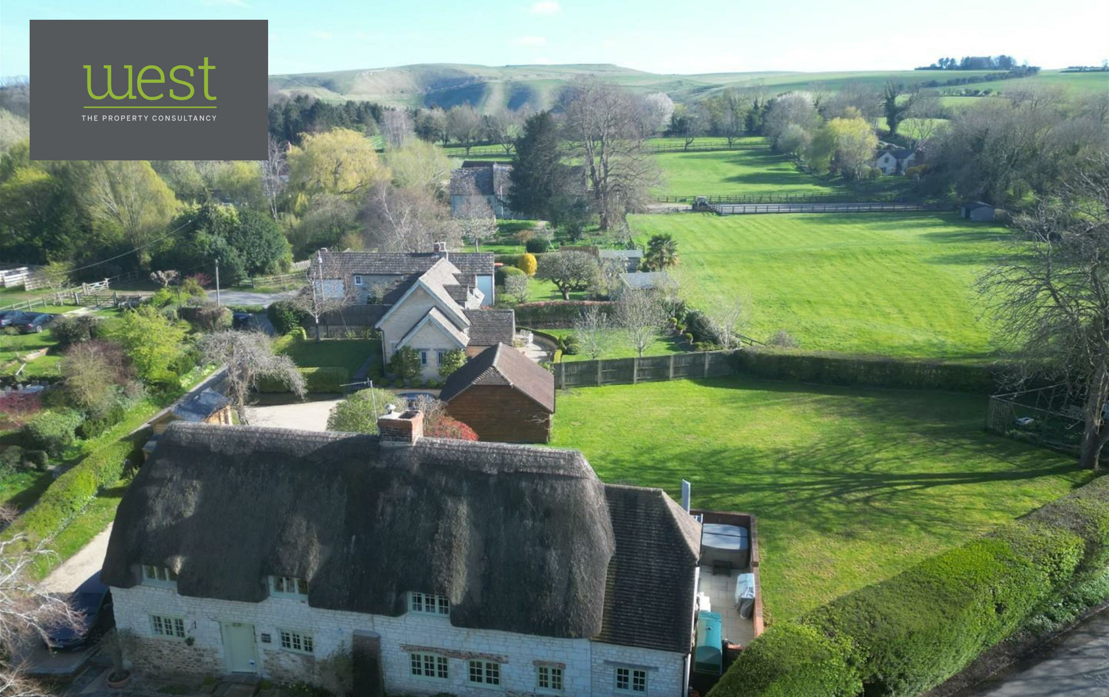
Beech Tree Cottage Church Lane, Woolstone, SN7 7QL Guide Price £950,000