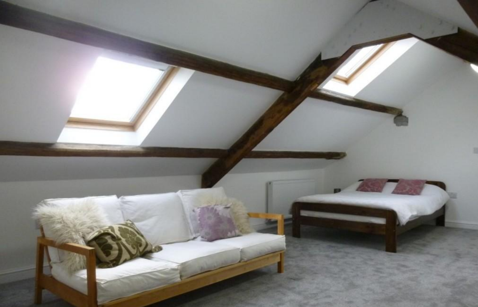
Open Plan Accomodation