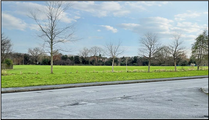
Oak Farm Close, Sutton Coldfield, B76 1PJ