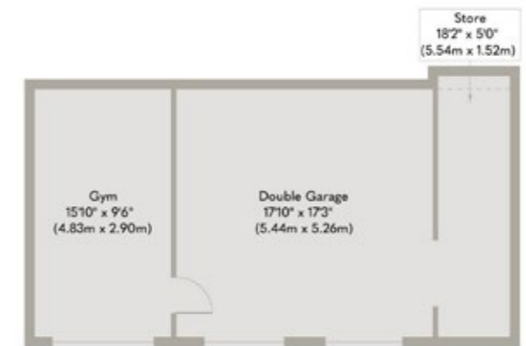
Outbuilding Approximate Floor Area 255 sq. ft (23.66 sq. m)

Whilst every attempt has been made to ensure the accuracy of the floor plan contained here, measurements of doors, windows, rooms and any other items are approximate and no responsibility is taken for any error, omission, or mis-statement. This plan is for illustrative purposes only and should be used as such by any prospective purchaser or tenant. The services, systems and appliances shown have not been tested and no guarantee as to their operability or efficiency can be given.