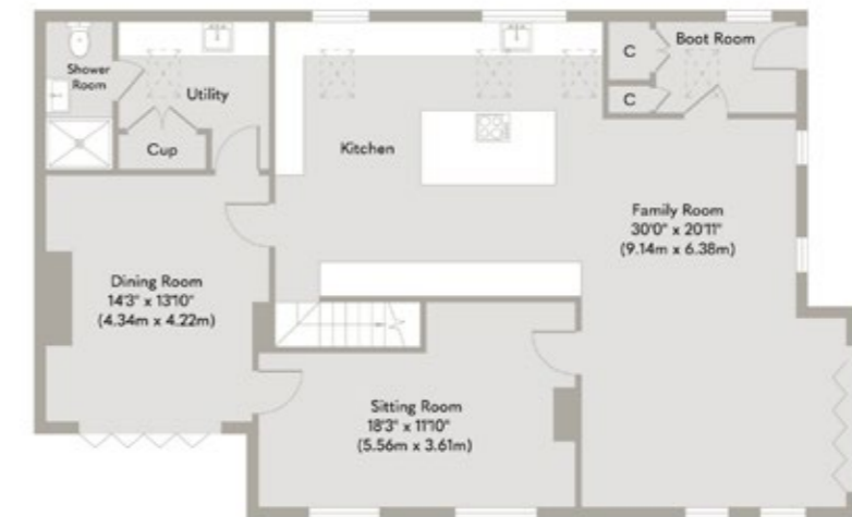
Ground Floor Approximate Floor Area 1180 sq. ft (109.63 sq. m)