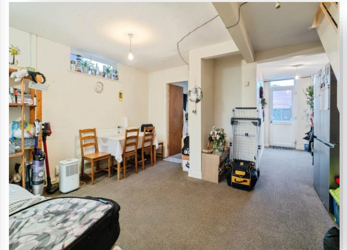
Lewis Road, Loughborough