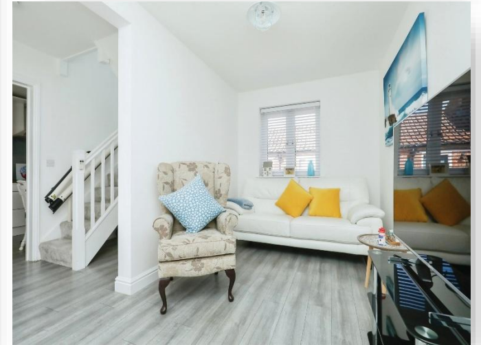
London Street, Swaffham, PE37 7DD