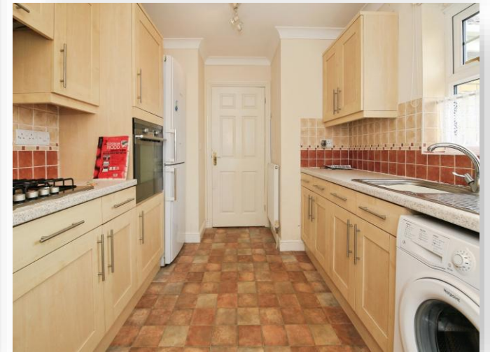
Cowslip Place, March PE15 8RZ