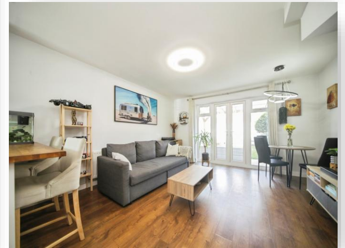
Fennel Drive, Red Lodge IP28 8UZ