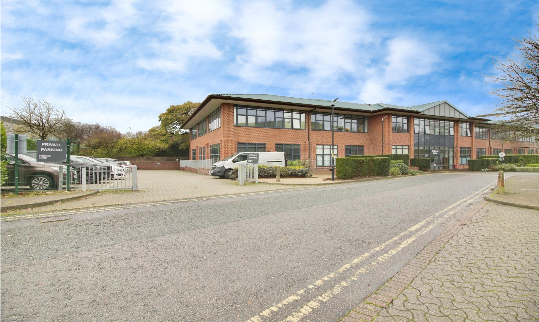
Sterling Court Mundells, Welwyn Garden City AL7 1FX