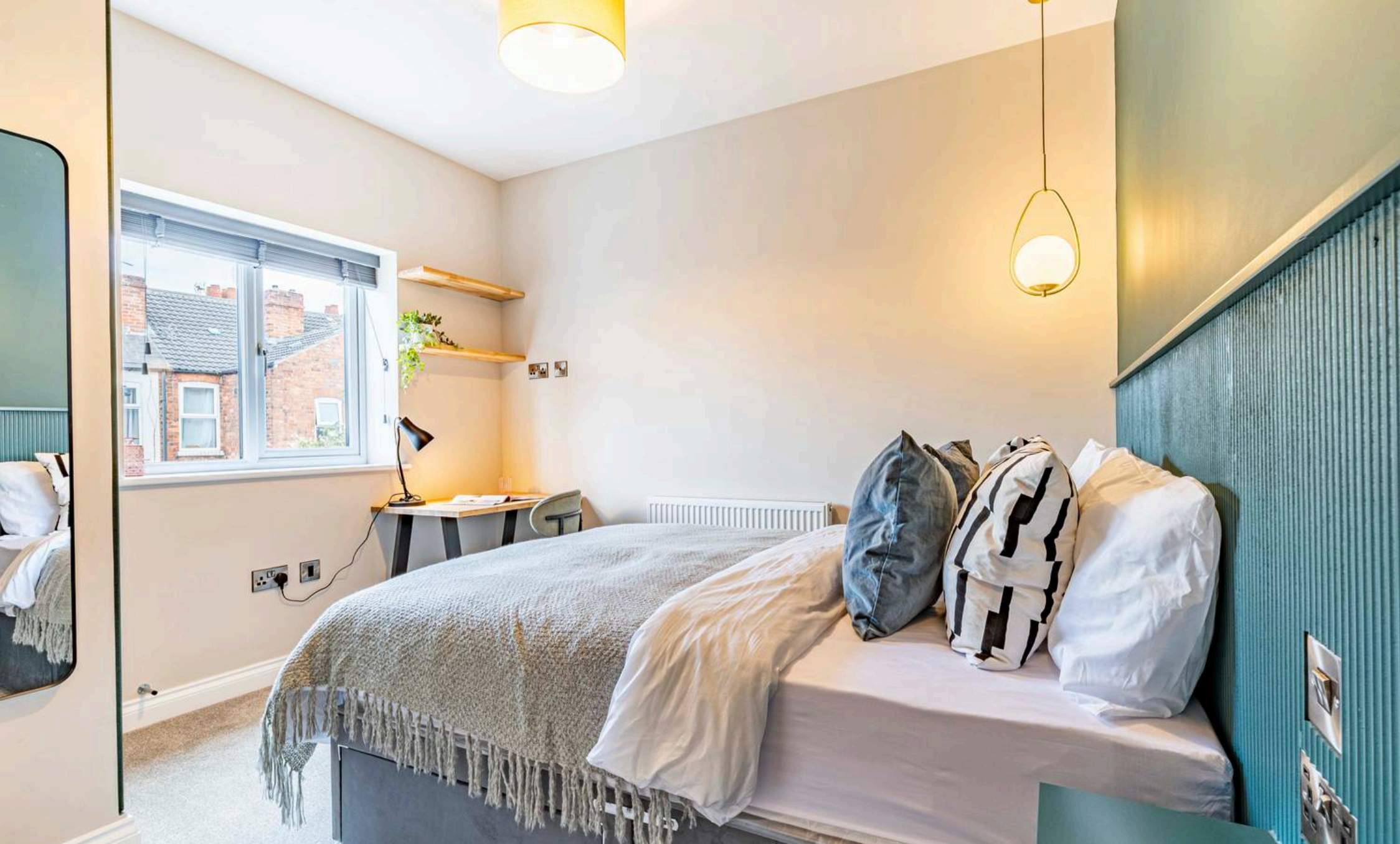
Room 6, Gladstone Street, Long Eaton £650 PCM