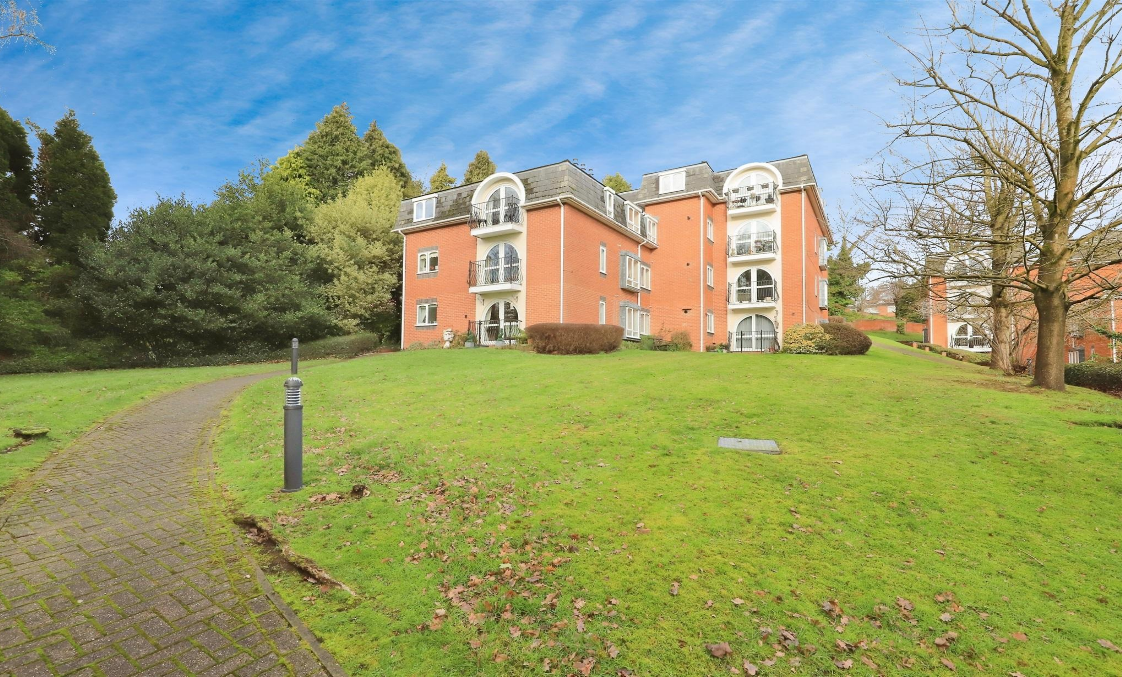
Fairways Court Oldnall Road,KIDDERMINSTER DY10 3HN