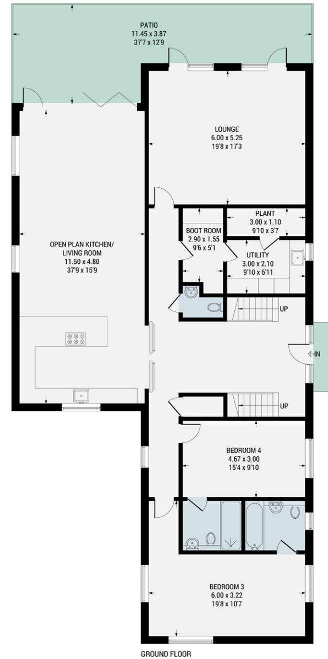
The Ash | 5 bedrooms 3,229 sq ft (300 sq m)