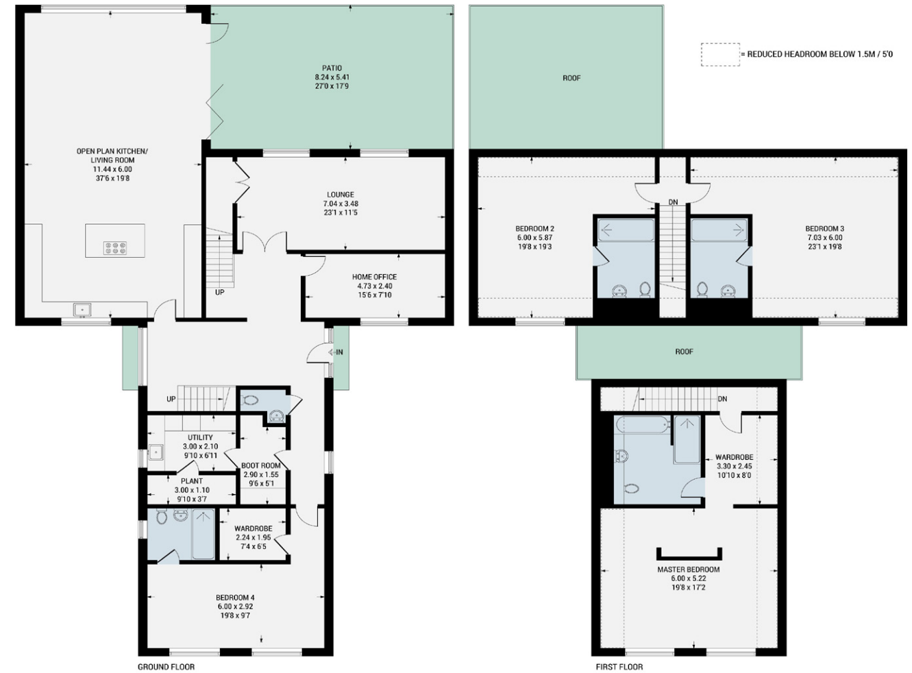
The Cedar | 4 bedrooms + home office 3,443 sq ft (320 sq m)

Each home offers between 300–320 sq m (3229–3443 sq ft) of internal space, with layouts designed to provide flexibility for home working, growing families, or multi-generational living.