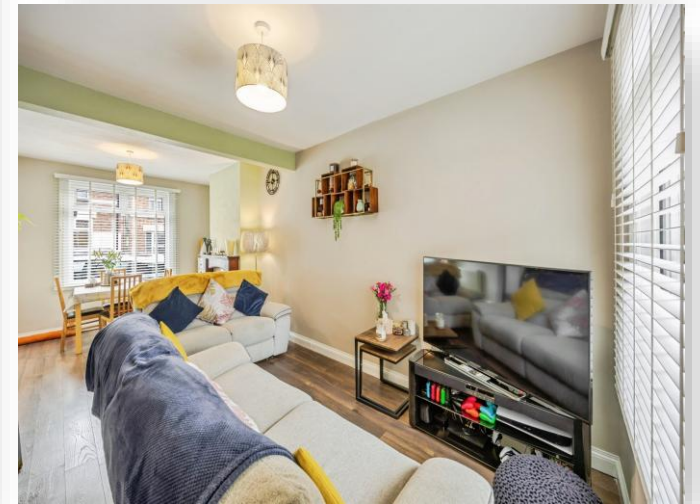
Baker Street, Northampton NN2 6DJ