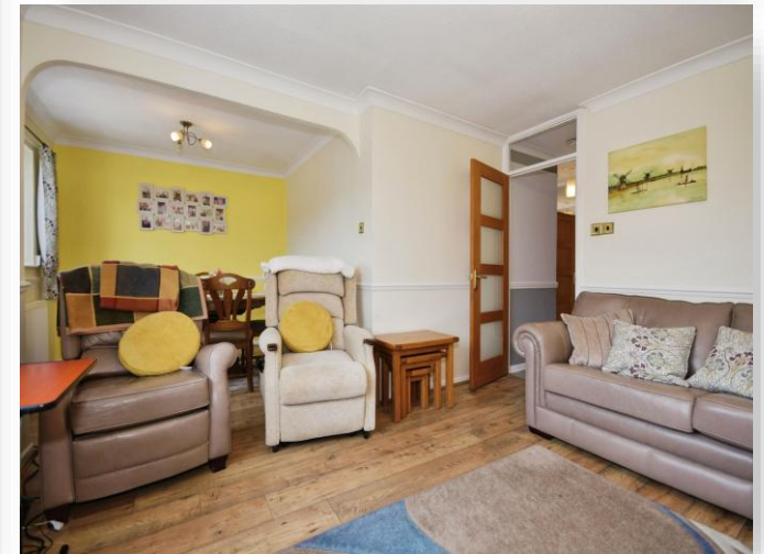
Hamilton Close, Mexborough S64 0QW