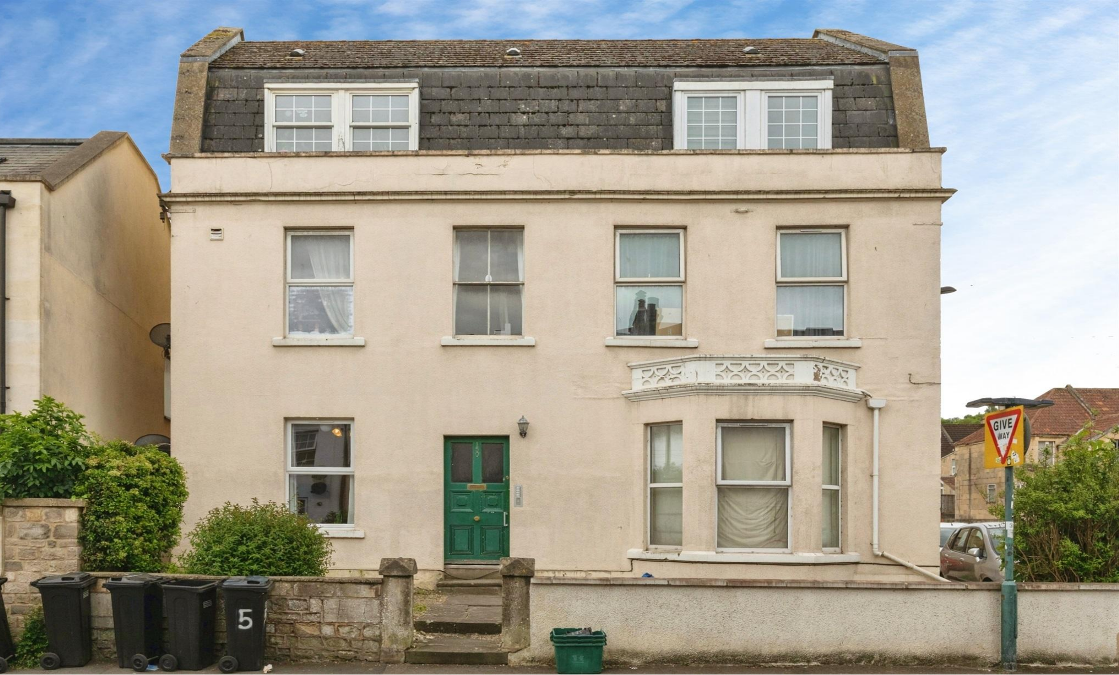
Flat 1 High Street, Twerton Bath BA2 1BY