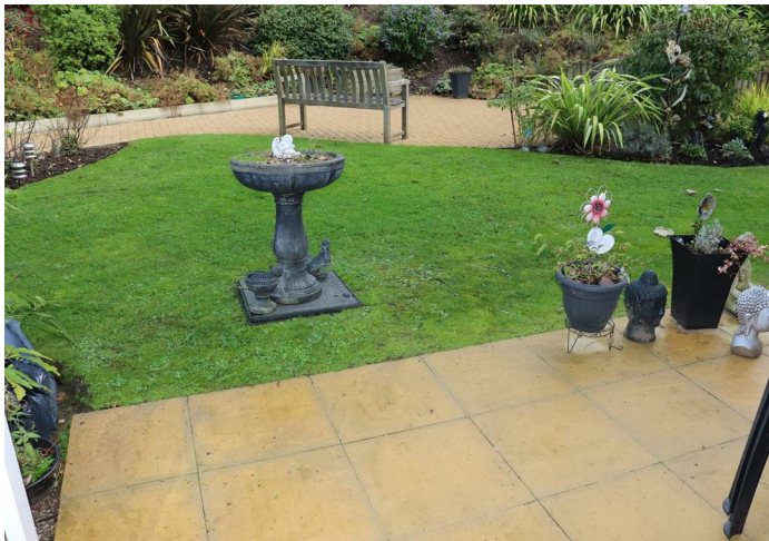
Small Patio Area