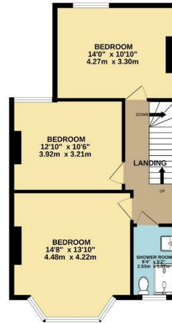
1ST FLOOR 603 sq.ft. (56.0 sq.m.) approx.