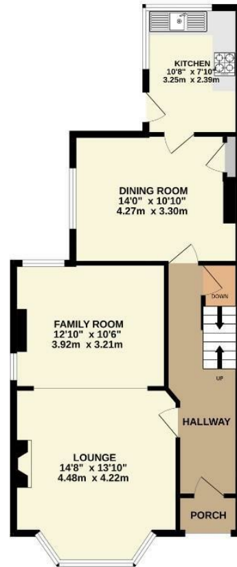
GROUND FLOOR 687 sq.ft. (63.8 sq.m.) approx.