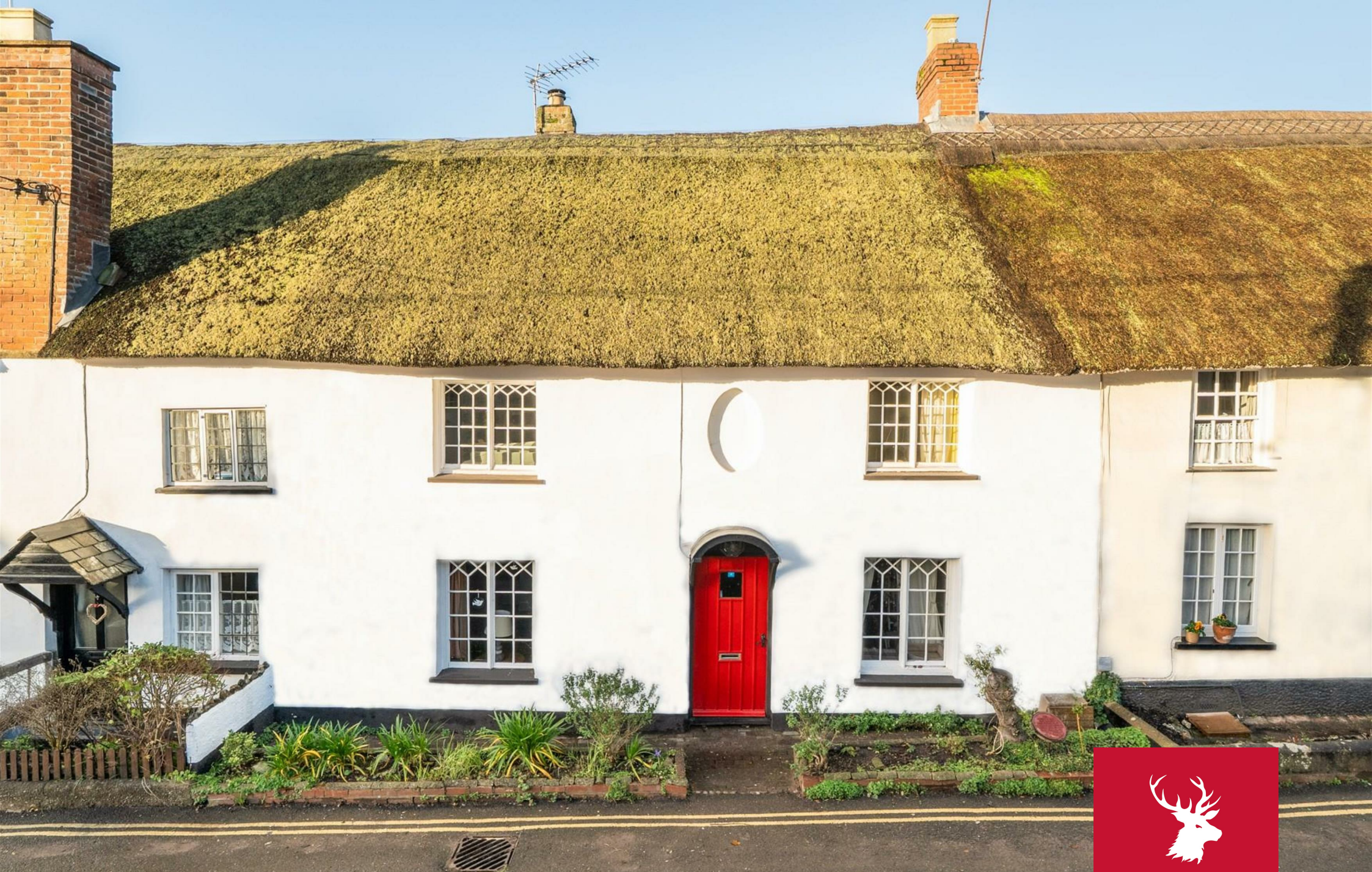
Holly Tree Cottage