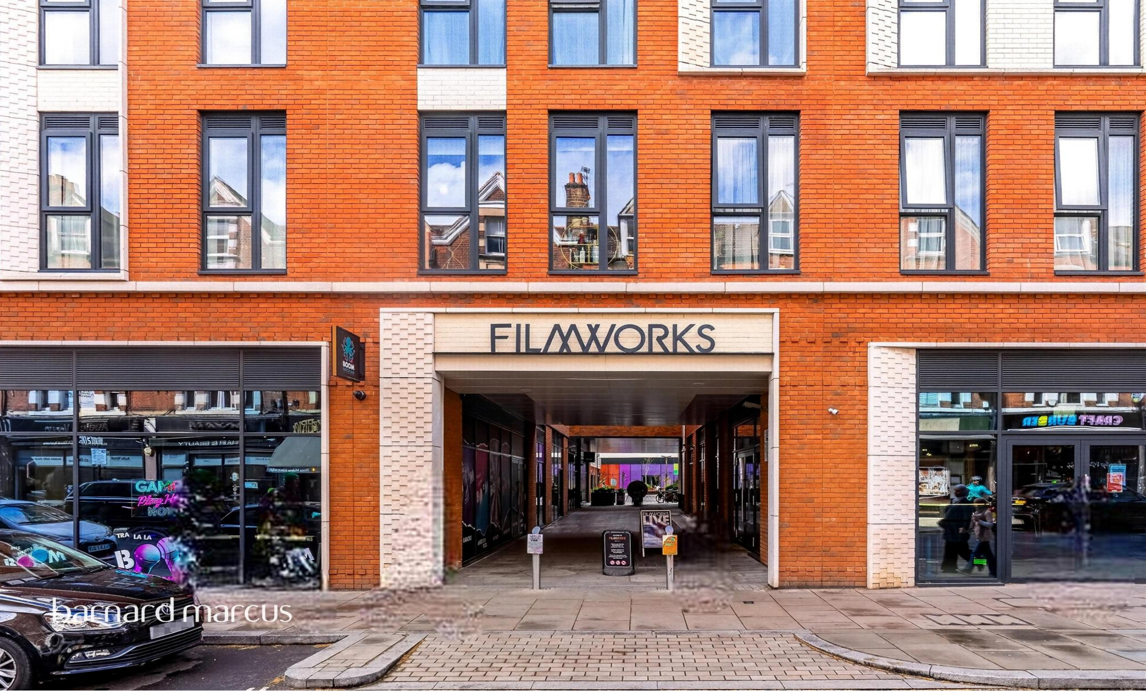
Hawkins House, Bond Street, London, W5 5DF