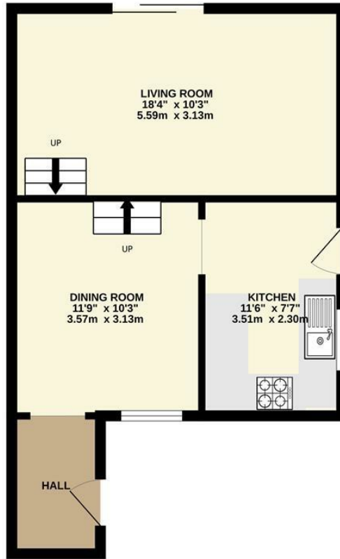
GROUND FLOOR 427 sq.ft. (39.7 sq.m.) approx.