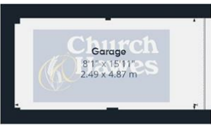
Floor 0 Building 3

Approximate total area ® 972 ft 2 90.3 m 2