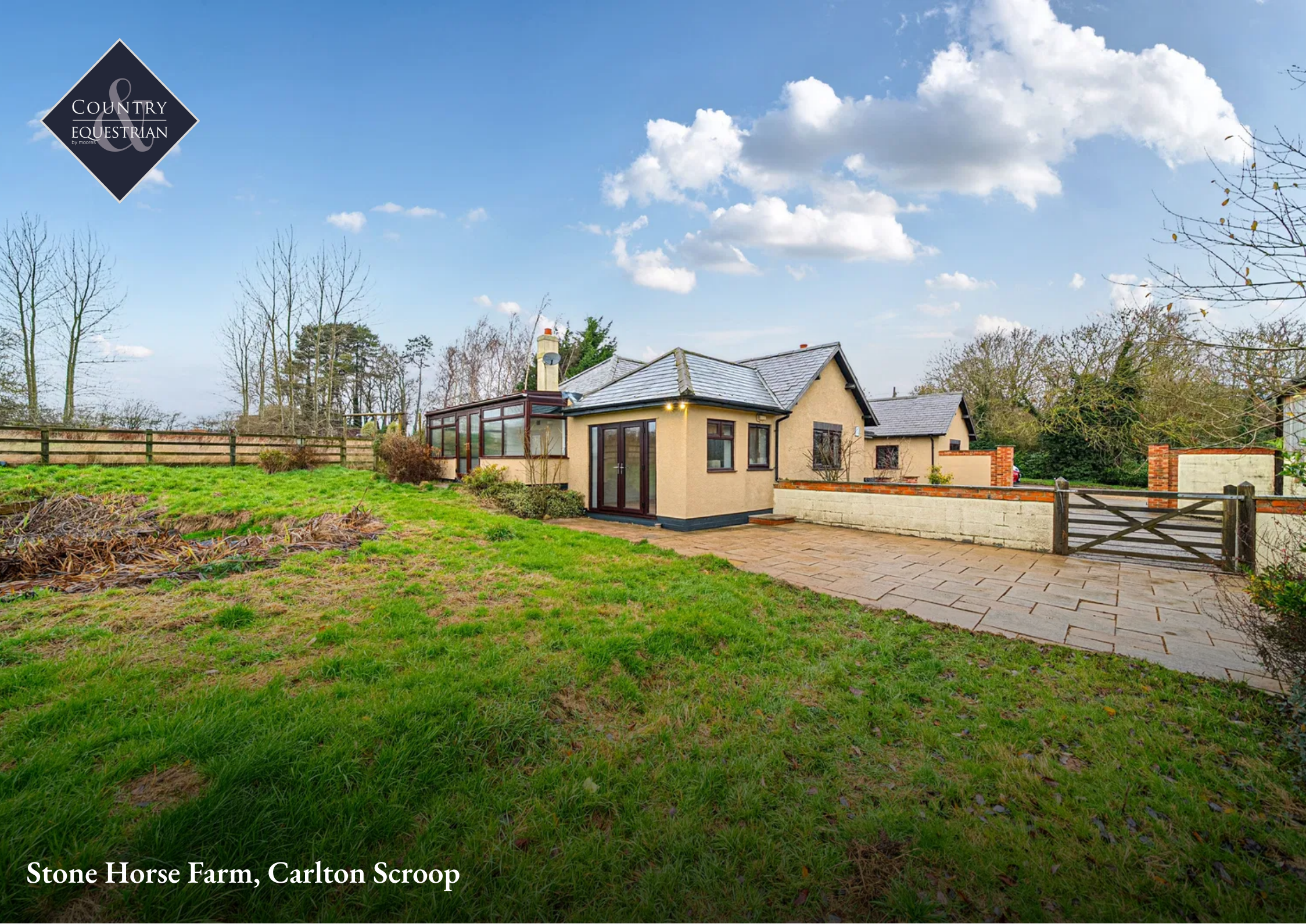
Stone Horse Farm, Carlton Scroop