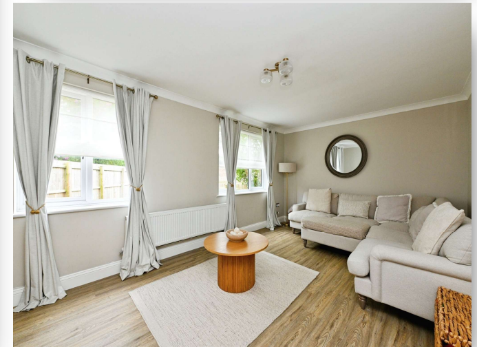
Beckett Close, North Wootton, King's Lynn, PE30 3QN