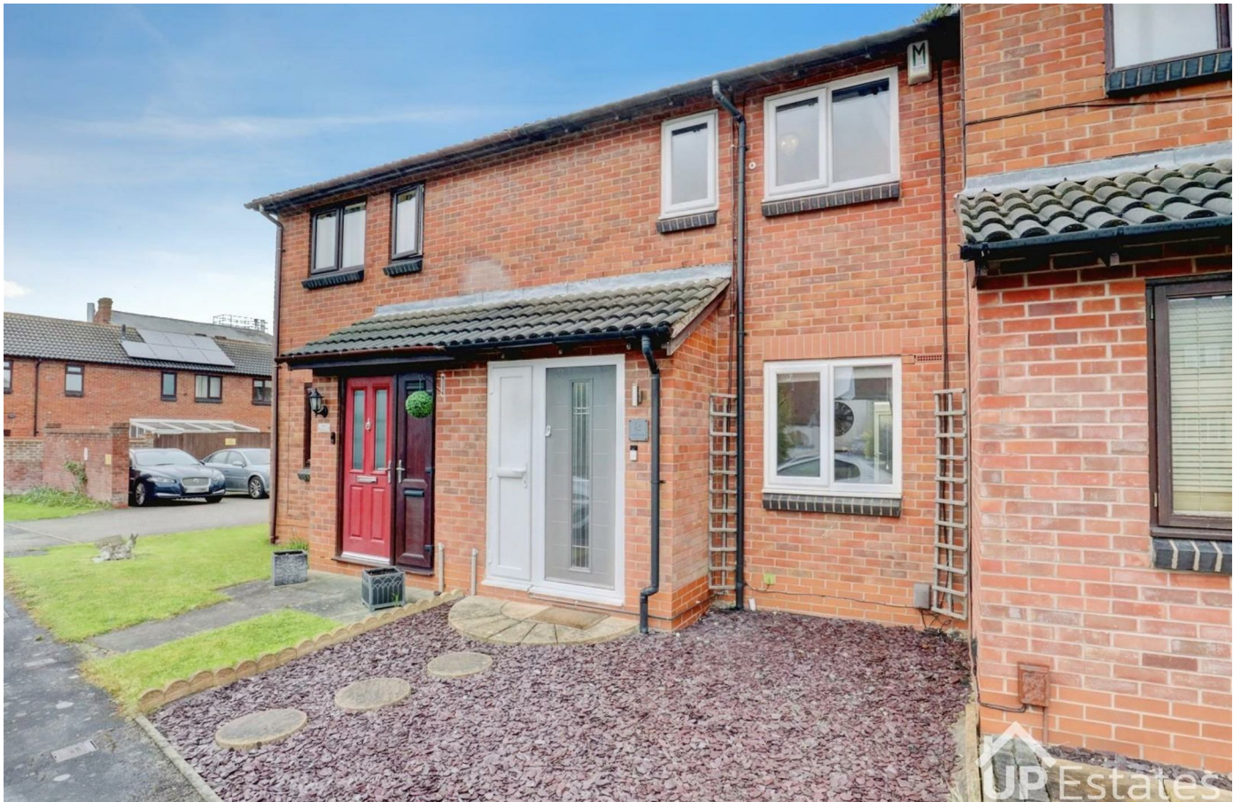
Keats Close, Earl Shilton, Leicester