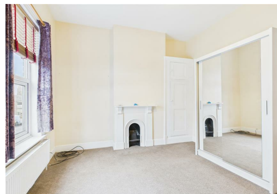
Bedroom 2 12'9" x 8'5" (3.91 x 2.57)