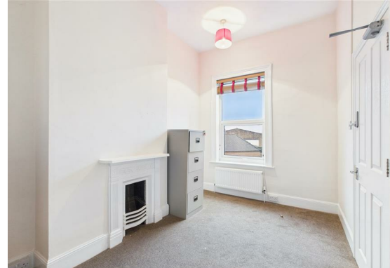
Lounge 11'10" x 11'1" (3.61 x 3.39)