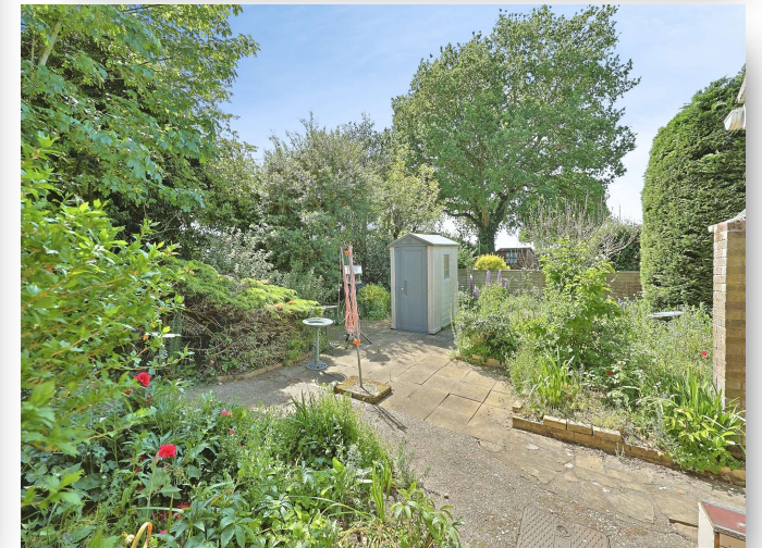
Larch Grove, North Elmham, Dereham, NR20 5JW