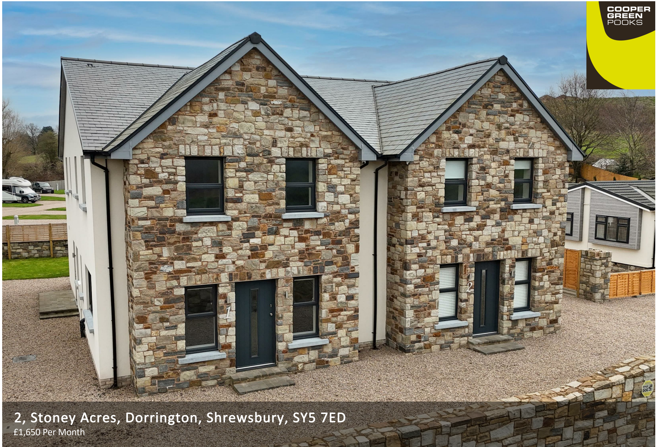
2, Stoney Acres, Dorrington, Shrewsbury, SY5 7ED £1,650 Per Month