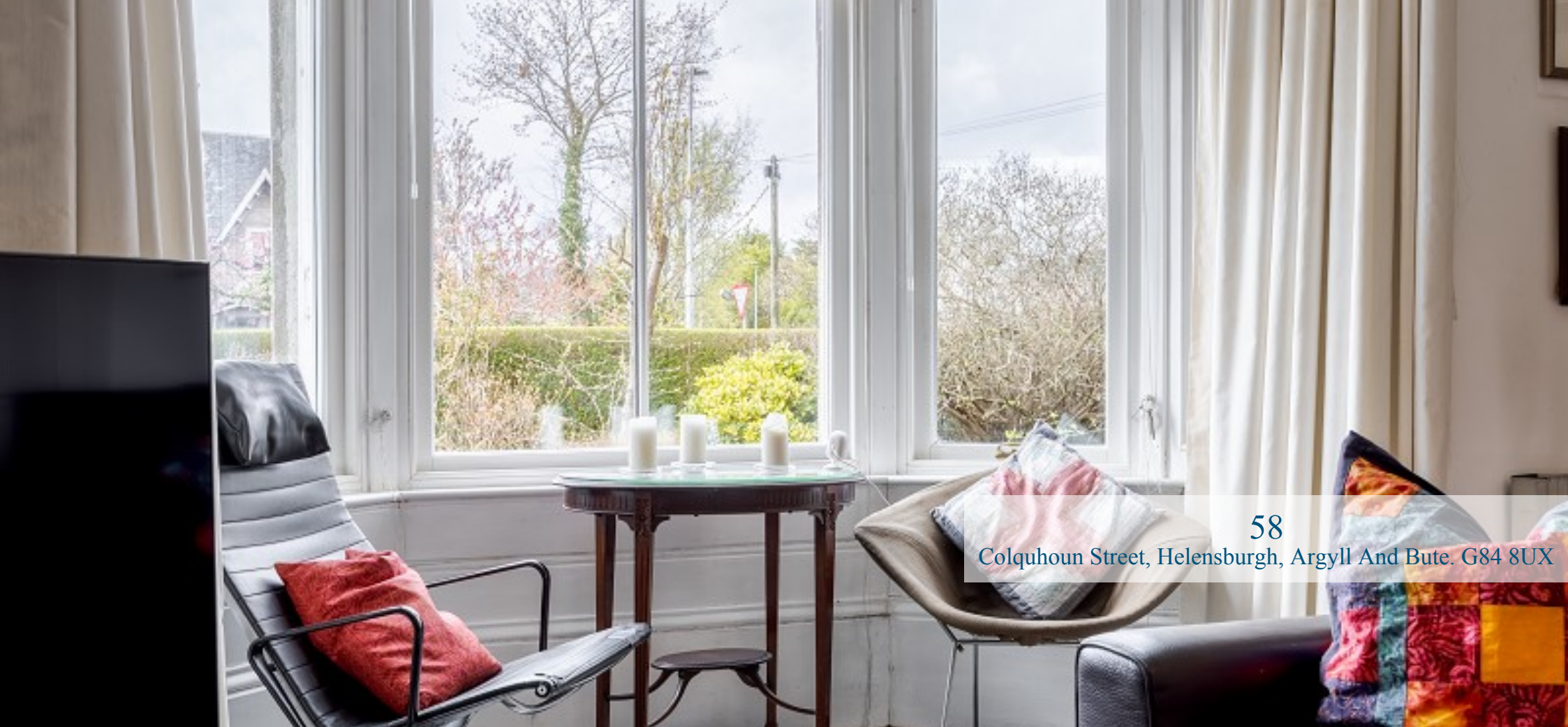
58 Colquhoun Street, Helensburgh, Argyll And Bute. G84 8UX