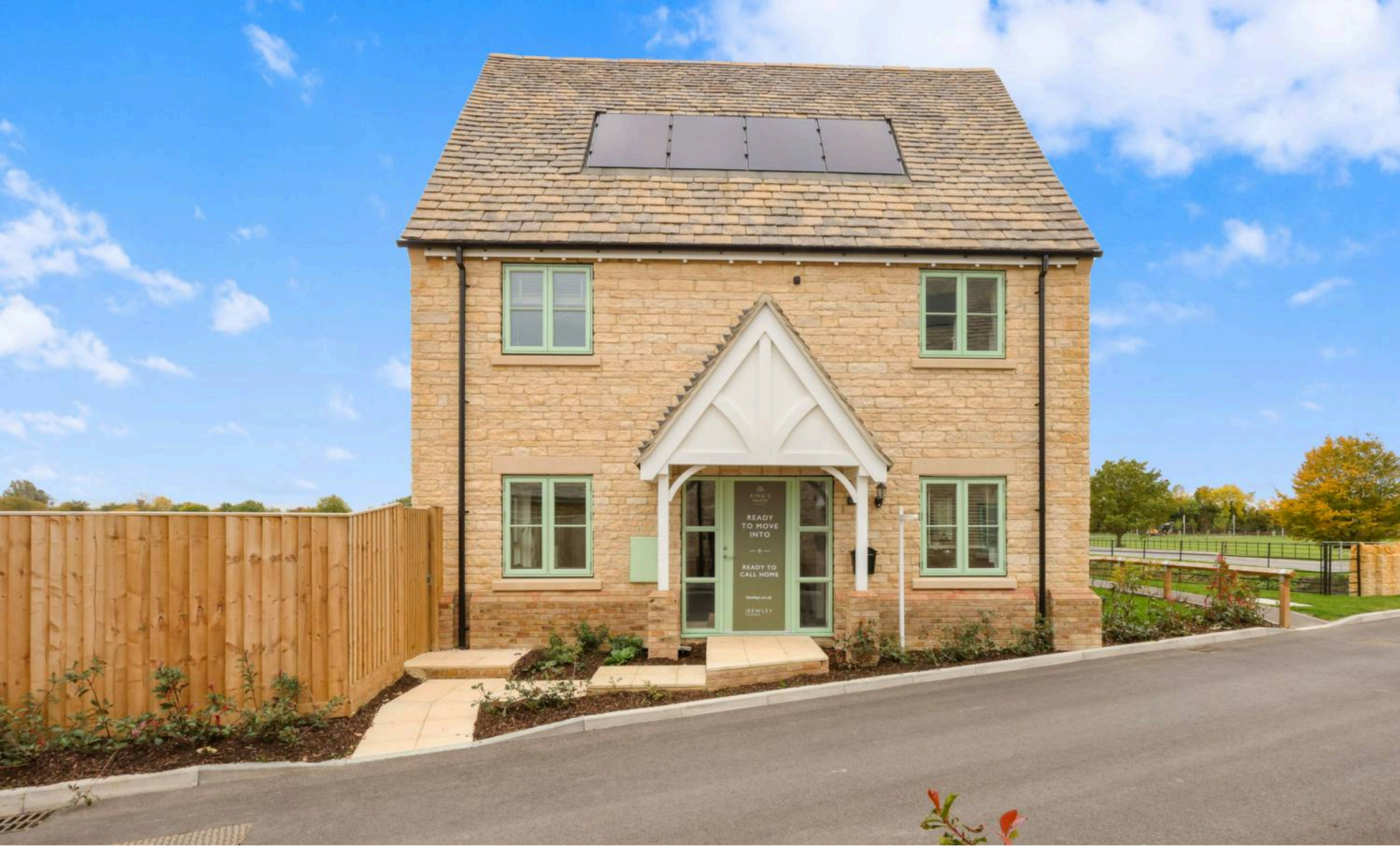
Corston Cottage, Spine Road West, Ashton Keynes