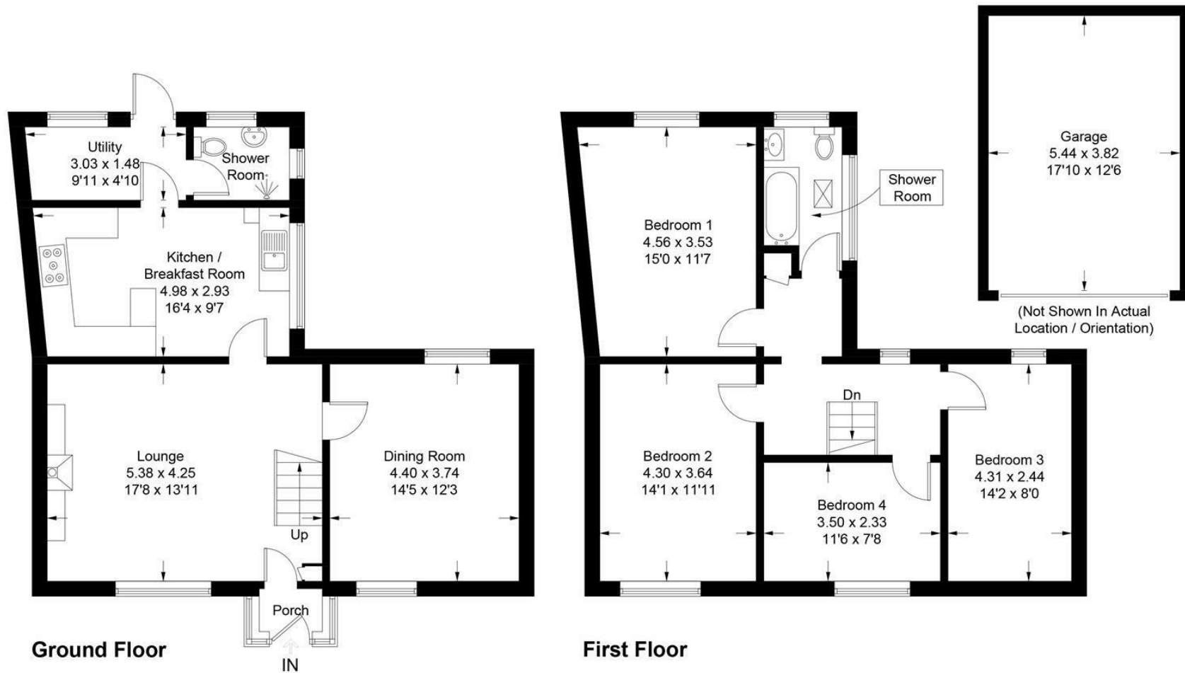
Illustration for identification purposes only, measurements are approximate, not to scale. Fourlabs.co © (ID1267403)

Approximate Gross Internal Area = 129.1 sq m / 1390 sq ft Garage = 20.7 sq m / 223 sq ft Total = 149.8 sq m / 1613 sq ft