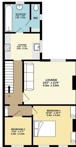
TOTAL FLOOR AREA: 576 sq ft. (53.5 sq m.) approx. While every effort has been made to ensure the accuracy of the floor plan, the measurement of doors, windows, stairs and any other items are approximate and no responsibility is taken for any errors, omissions or misstatements. This plan is for general guidance only and should be used as a guide to the proposed purchase. The seller, agent and agent's staff do not warrant the accuracy of the floor plan. All measurements are in feet and inches unless otherwise stated. ©2020

Council: Waltham Forest | Council Tax Band: C | Floor Area: 576.00 sq ft