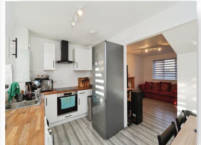
Cabin Leas, Loughborough