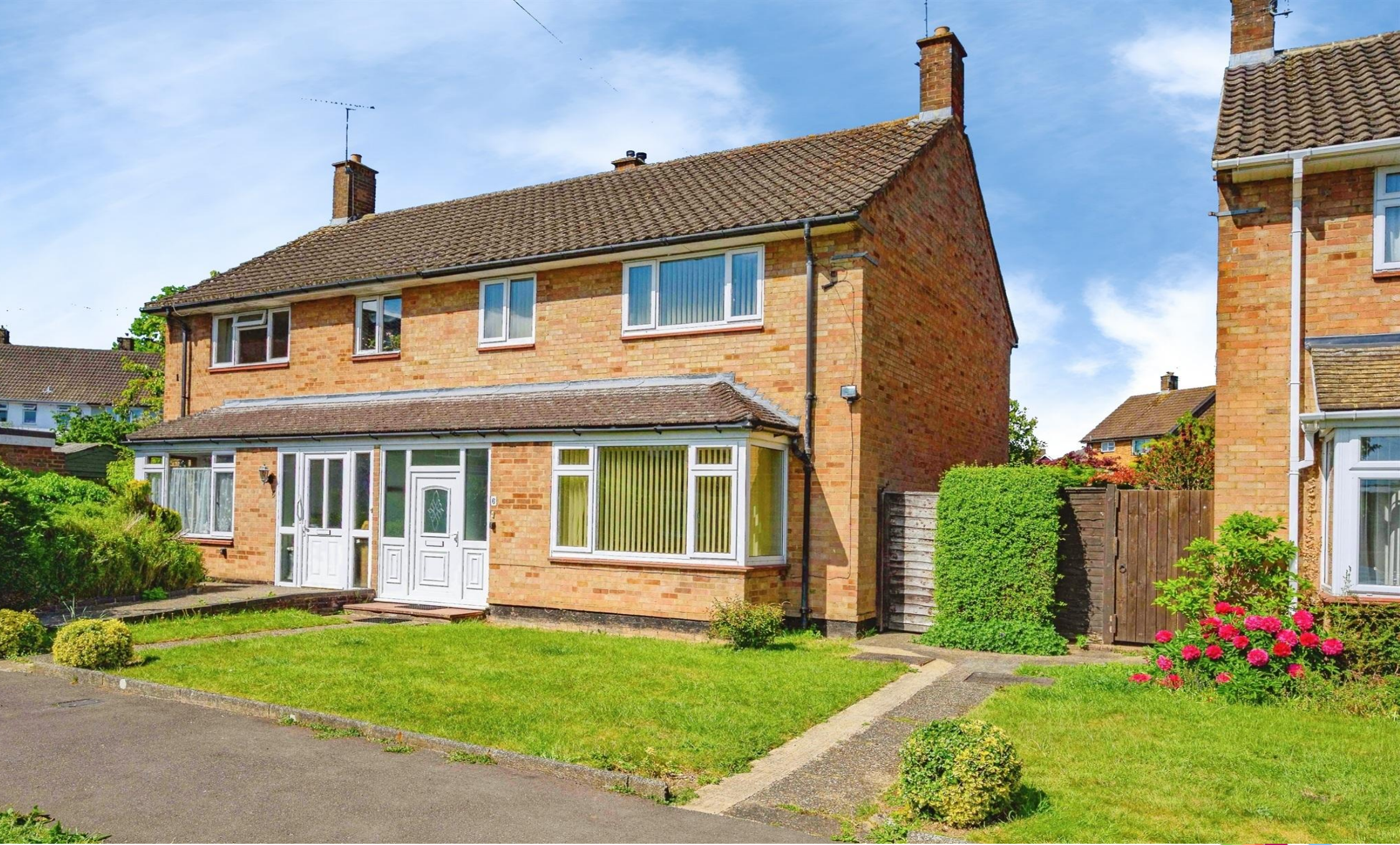
Winding Shot, Hemel Hempstead HP1 3QQ